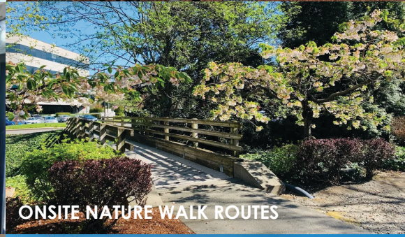
ONSITE NATURE WALK ROUTES