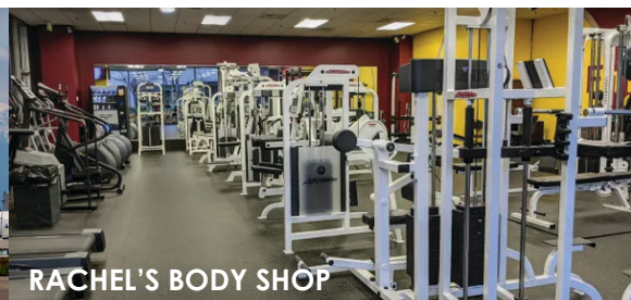
RACHEL'S BODY SHOP