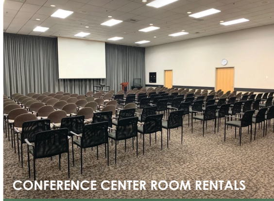
CONFERENCE CENTER ROOM RENTALS