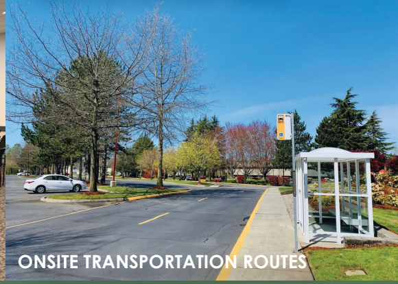
ONSITE TRANSPORTATION ROUTES