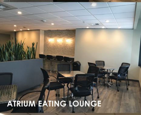
ATRIUM EATING LOUNGE