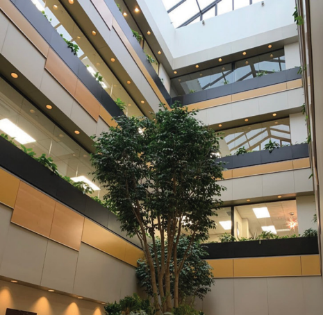
ATRIUM MAIN LOBBY