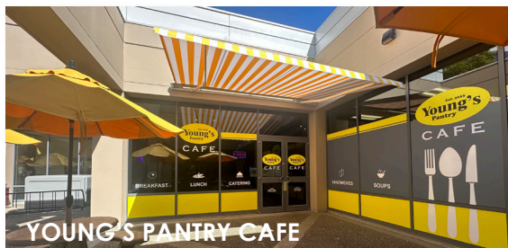
YOUNG'S PANTRY CAFE