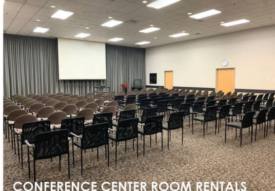
CONFERENCE CENTER ROOM RENTALS