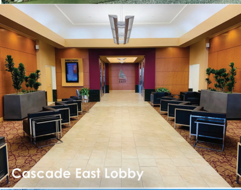
Cascade East Lobby