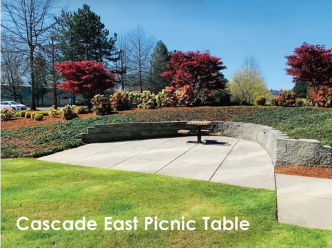
Cascade East Picnic Table