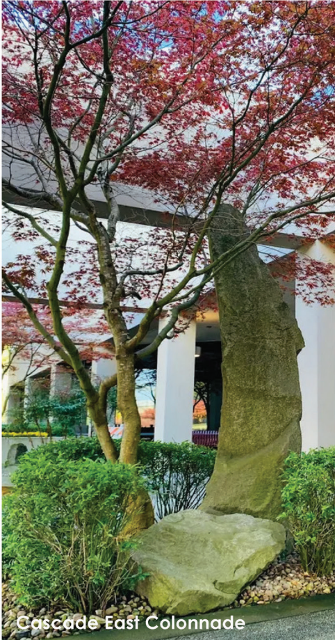
Cascade East Colonnade