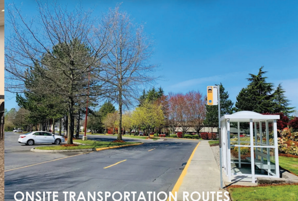
ONSITE TRANSPORTATION ROUTES