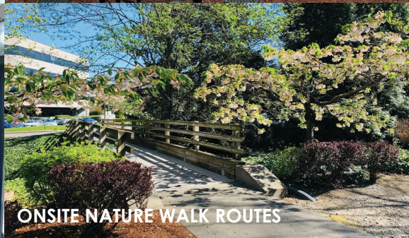
ONSITE NATURE WALK ROUTES