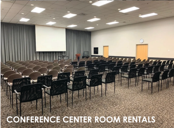
CONFERENCE CENTER ROOM RENTALS