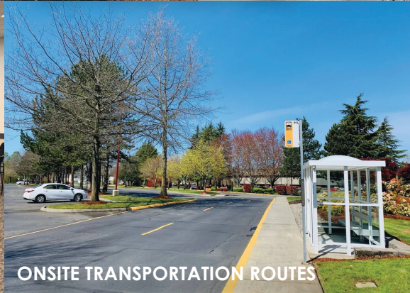
ONSITE TRANSPORTATION ROUTES