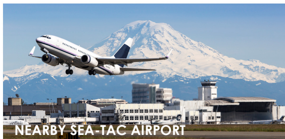
NEARBY SEA-TAC AIRPORT