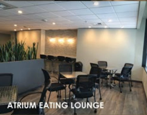
ATRIUM EATING LOUNGE