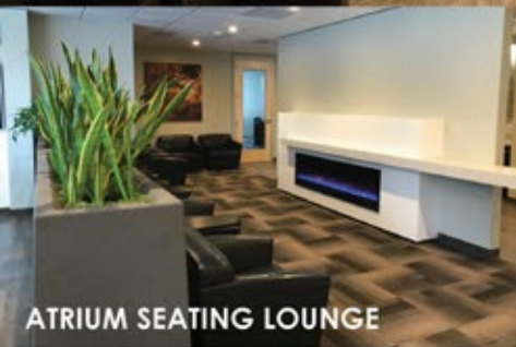
ATRIUM SEATING LOUNGE