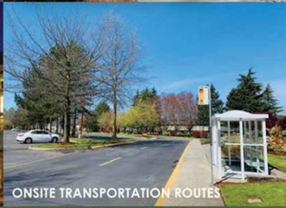
ONSITE TRANSPORTATION ROUTES