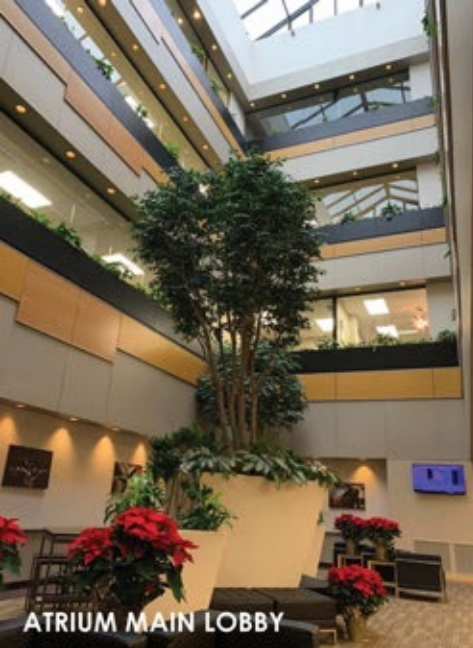
ATRIUM MAIN LOBBY