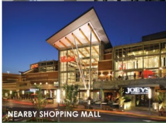
NEARBY SHOPPING MALL