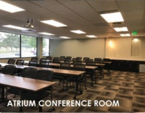
ATRIUM CONFERENCE ROOM