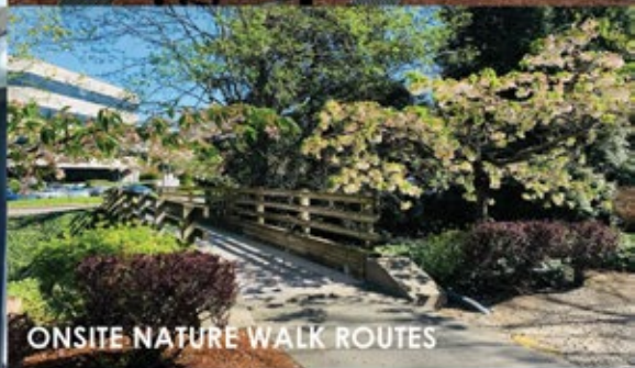
ONSITE NATURE WALK ROUTES